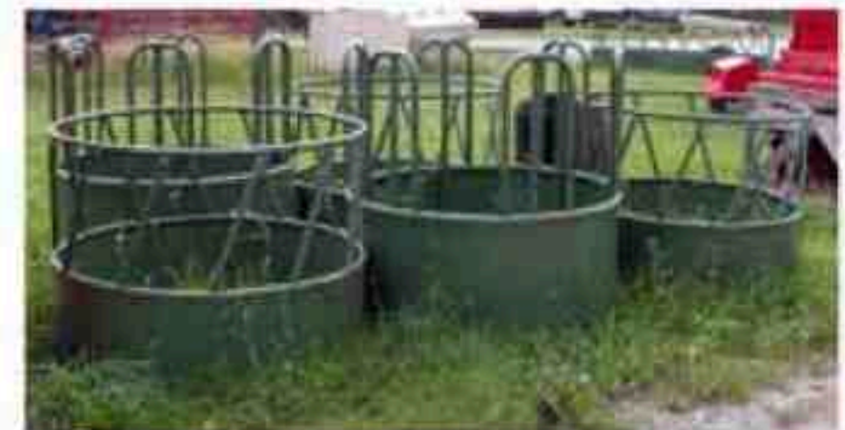
R4U round horse feeders and R4 feeders

JR6 - 2 half rounds 6 ft. in diameter JR7 - 2 half rounds 7 ft. in diameter